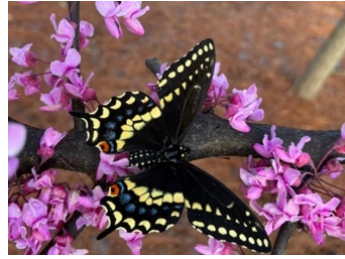
Miniature swallowtail butterfly