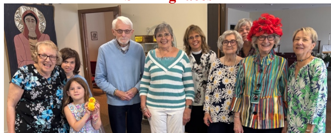
Easter Sunday ~Someone wore a bonnet!