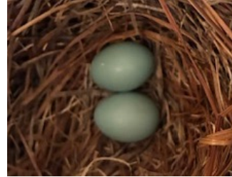
Bluebird eggs (a nesting in progress)