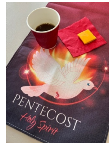
Coffee Hour, Day of Pentecost, May 24