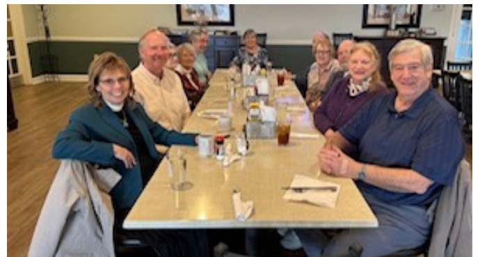
Lunch at Southside Bar and Grill following a Sunday Service