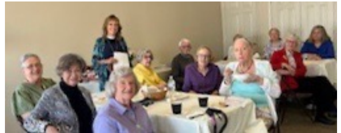
Lenten Study Group