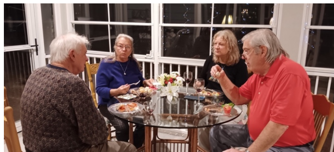
A gathering in the sunroom