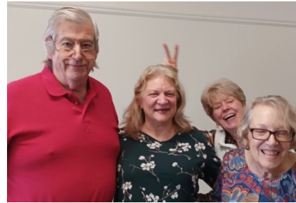
Who is that photo bomber?