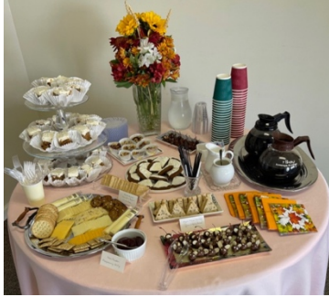
St. MM bakers show off a bit. Front row, a tray of "Church Mice" baked by Lloyd Brewer