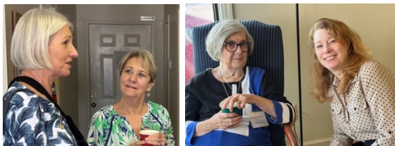
Coffee drinkers enjoy a chat