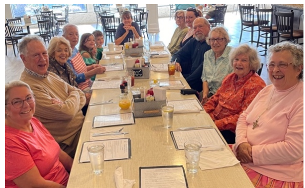
Following the Oct. 19, worship service, friends gathered at Seven Lakes Golf Club for brunch/lunch.