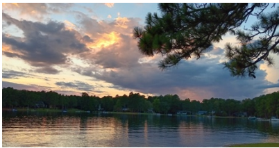
Dusk at Lake Sequoia