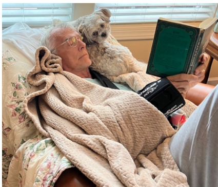
Our Vicar in dry-dock