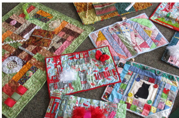
The colorful, heavily adorned, tactile quilts are designed to keep restless hands occupied