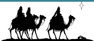
The Work of Christmas

When the star in the sky is gone When the kings and princes are home When the shepherds are back with their flocks The work of Christmas begins: To find the lost, To heal the broken, To feed the hungry, To release the prisoners, To rebuild the nations, To bring peace among brothers, To make music in the heart Howard Thurman