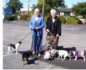
Animal Blessing, Oct. 2014