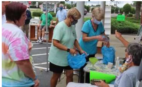
Vigorous sales on Saturday