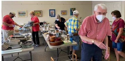
Thursday morning - Workers show up for sorting and pricing