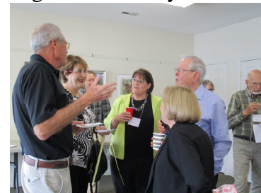
Coffee fellowship hour 2019 We will do this again!