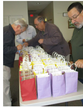
Workers prepare gift bags for golf tournament participants